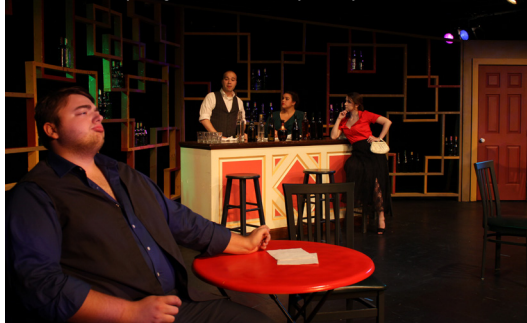
Picasso at the Lapin Agile